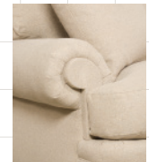
8 Raised Panel Arm