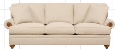
3 3 Seat Cushions/3 Back Pillows

1 Seat, 2 Seat and 3 Seat configurations are available on ES, S and MS. 1 Seat and 2 Seat configurations are available on L and ML. All other unit styles have a standard cushion configuration — no need to specify seat cushion. *Throw pillows are 21" and follow the stitch on the seat cushion/back pillow selected.