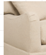
7 Modern English Arm