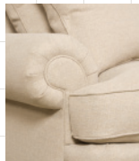
1 Roll Arm