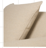
E Multi Pillow Back Welted (not available in leather)