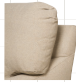
D Knife Edge English Seam