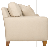
S Standard Depth 22" seat depth, 40" overall