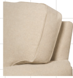
A Box Welted