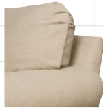
C Knife Edge Welted