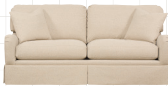
2 2 Seat Cushions/2 Back Pillows