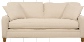
1 1 Seat Cushion/2 Back Pillows