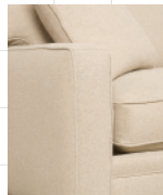
5 Track Arm