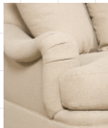
2 Classic English Arm