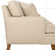
X Deep Depth 24" seat depth, 42" overall