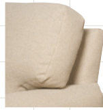
B Box English Seam