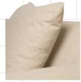
F Multi Pillow Back English Seam (not available in leather)