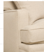
6 T-Cushion Track Arm