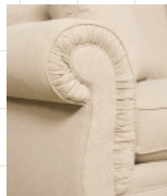
3 Bombay Arm