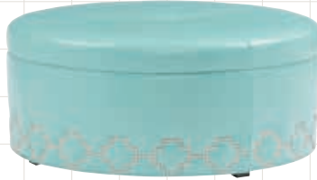
L40D6XMK PERSONALIZED OTTOMAN Leather Upholstered, 40" Round, Base to the Floor, No Molding, Mitered Top with Button, Tiles Nail Trim