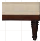
2 Turned Leg