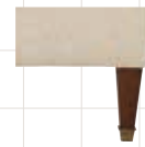
9 Leg with Antique Brass Ferrule