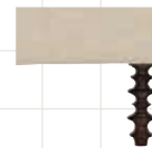
8 Spool Leg