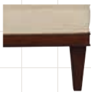
1 Plain Tapered Leg