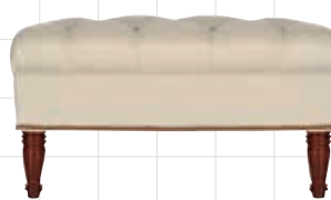
Thin Rectangular (T)

48T W 48 D 36 H 18.5 52T W 52 D 36 H 18.5 56T W 56 D 36 H 18.5 60T W 60 D 36 H 18.5