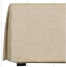
3* 12" Dressmaker Skirt (fabric only)