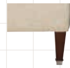
0 Leg with Brushed Nickel Ferrule

*Optional casters are available on skirt and base to the floor versions.