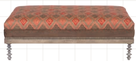
V52T8APO PERSONALIZED OTTOMAN Fabric Upholstered, 52" Thin Rectangular, Spool Leg, Plain Square Molding, Plain Top, Single Row Nail Trim